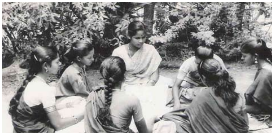
Community level workshops for adolescent girls, Photo by RUWSEC

This paper describes lessons learned about strategies to address rural women's health issues, through the work of Rural Women's Social Education Centre (RUWSEC). Established in the early 1980s in the sub-district of Chengalpattu in Tamil Nadu, India, RUWSEC is a grassroots women's organisation seeking to address women's sexual and reproductive health and rights (SRHR) issues.